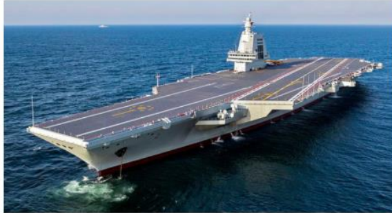
Setting sail: China's third aircraft carrier, Fujian, conducts its maiden sea trial on May 01.

Named after East China's Fujian Province and given the hull number 18, the