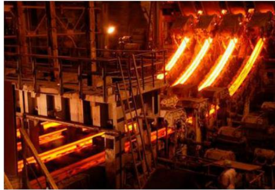
Lifeline in jeopardy: The average daily requirement of coal is about 12,000 tonne for normal production.

lossal debt looming large, borrowing for additional raw materials is "not an immediate option".