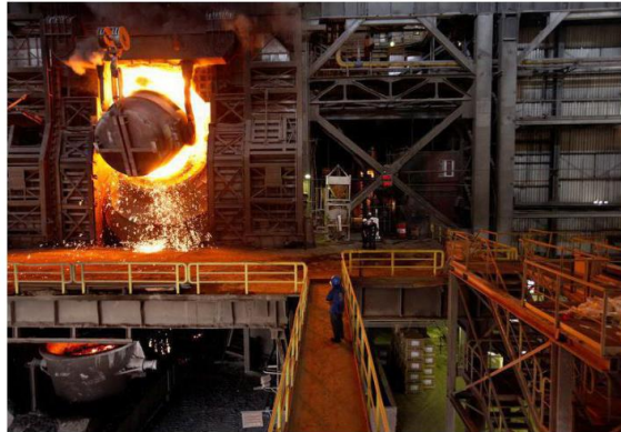
Sops crucial: There needs to be price incentive to decarbonise steel.

massive obstacle is the current pricing structure for steel, given that as yet there is no real premium for producing low-carbon metal in Asia and little sign that is on the horizon.